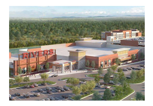
TBA (Venue subject to change) April 12<sup>th</sup> and 13th Schenectady, NY